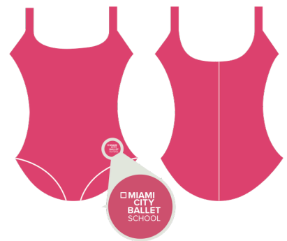
BALLET PREP III Rose