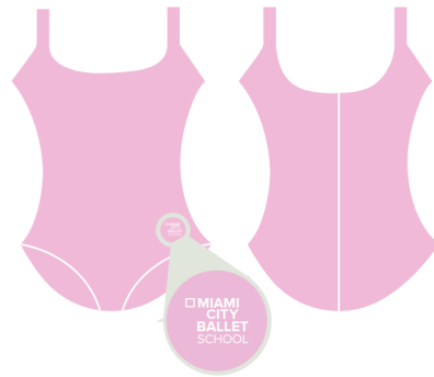
PRE-BALLET Light Pink