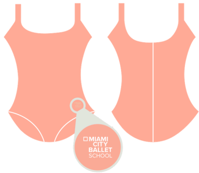
CREATIVE MOVEMENT Peach